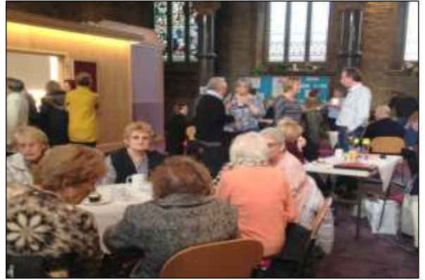
2, Visitors enjoyed their refreshments