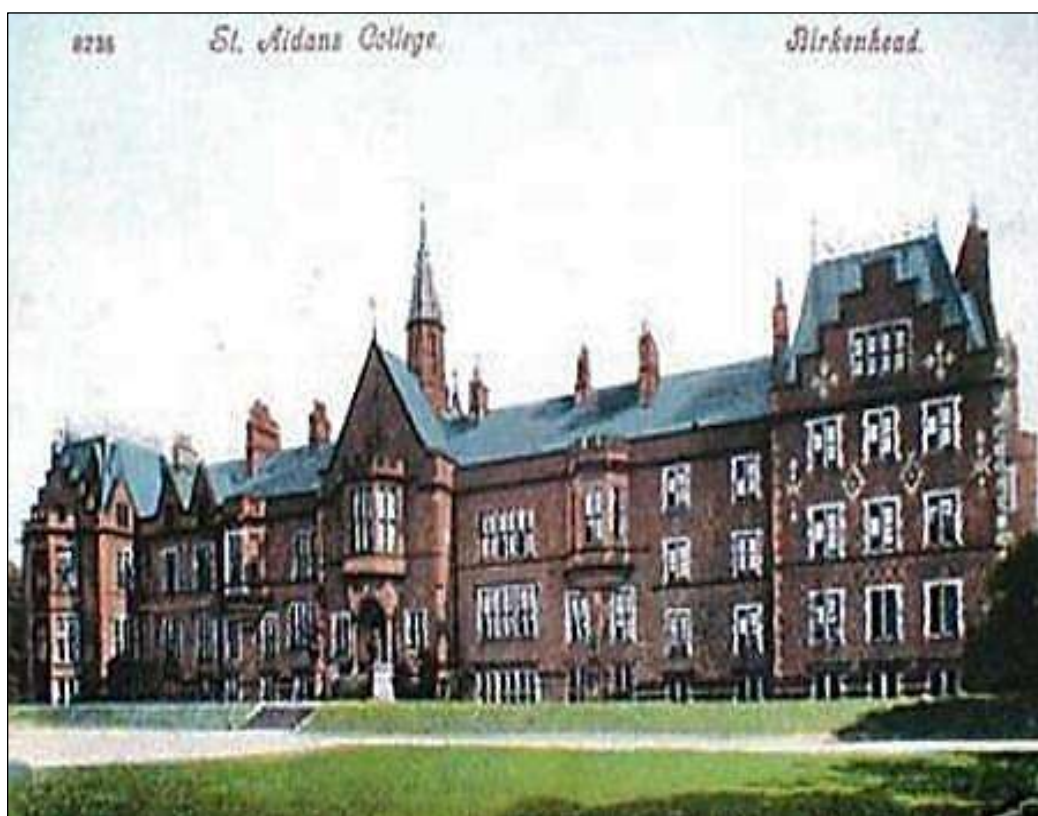
St Aidan’s Theological College, demolished in 1969