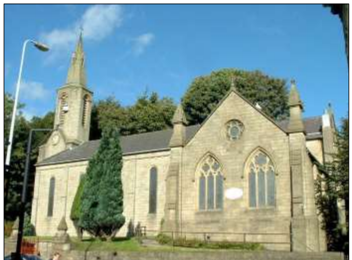
Holy Trinity, Tunstall, Stacksteads

time was the building of the New Schools at a cost of £4,000 and that in today’s money would exceed £100 Thousand. They were accounted the best and most complete schools in the Valley.