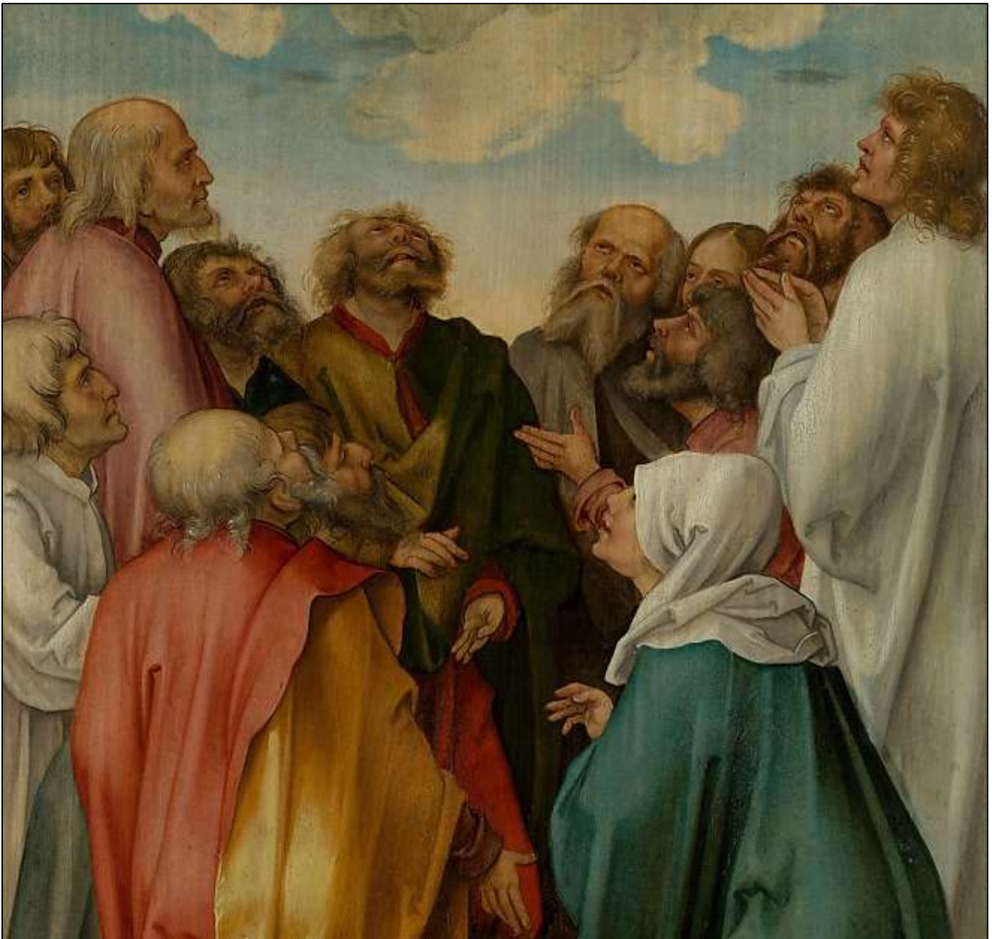
The Ascension: Hans Süss von Kulmbach, c513 (Metropolitan Museum of Art)