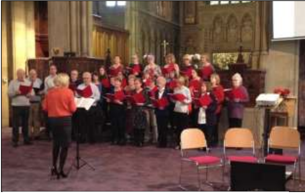
1, Walshaw Community Choir entertains